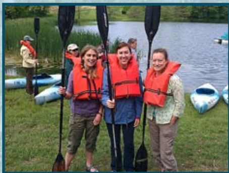
Nebraska Master Naturalist Program