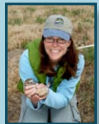
Banding Burrowing Owls with the Idaho Master Naturalist Program

"ANROSP provides us the support, framework, information, and materials necessary to launch a successful Master Naturalist Program in our state. We couldn't do it without them".