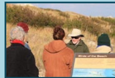
Richard Stockton College Certified Interpretive Guide course at the Cape May National Wildlife Refuge at Diamond Beach, NJ